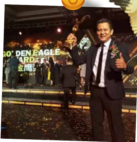
• We bagged another award in 2018! The Golden Eagle Award by Chinese Media Nanyang Siang Pau