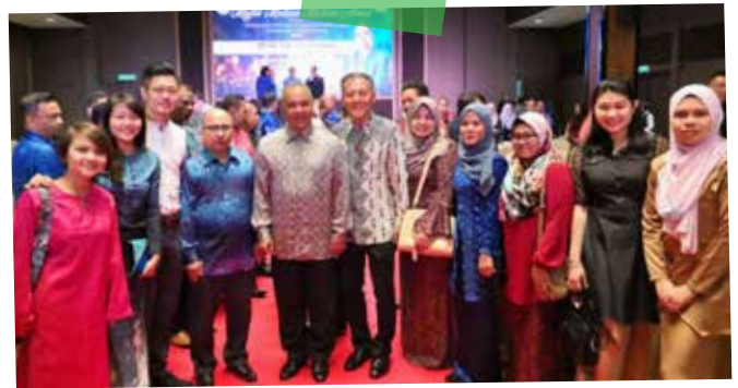
• The Respack team with the Deputy Finance Minister of Malaysia Dato' Amiruddin Hamzah at the Charity Event for thalassemia patients organised by the Malaysian Customs Department