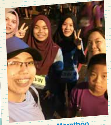
Malaysia Day Marathon Before marathon starts.

Our latest sports gathering was on the 23rd of September, the Malaysia Day marathon where a group of us have taken on the 6km and 12km run respectively. This was our 2nd participation in a marathon after the fun-filled first event which was the Chocolate Run held in March, 2017. Here are some of our photo collections during the Marathon Run!