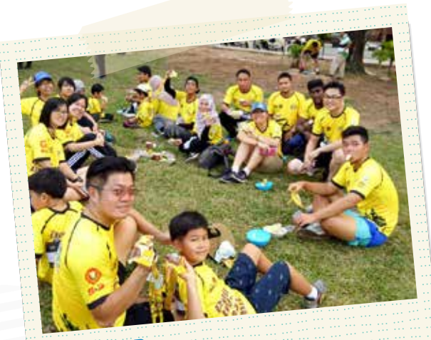
Chocolate Run Chilling together after having the run